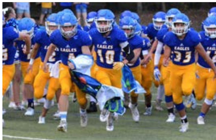
Southlake Christian Academy