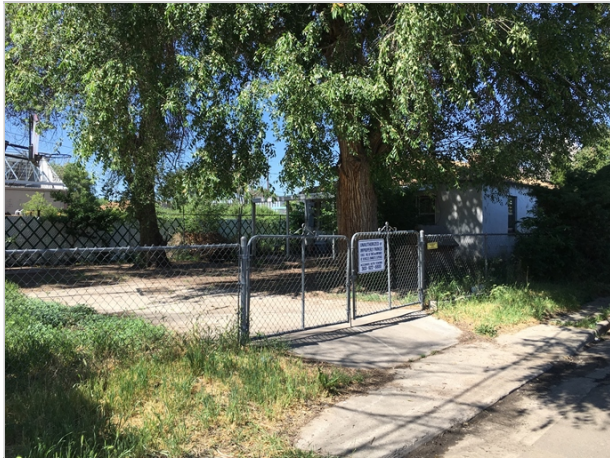
Ideal Live/Work: 1,128SF "House" On 6,350SF Lot