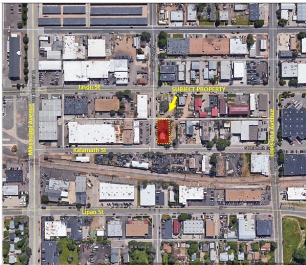
Ideal Live/Work: 1,128SF "House" On 6,350SF Lot