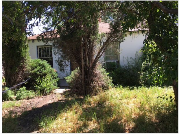
Ideal Live/Work: 1,128SF "House" On 6,350SF Lot