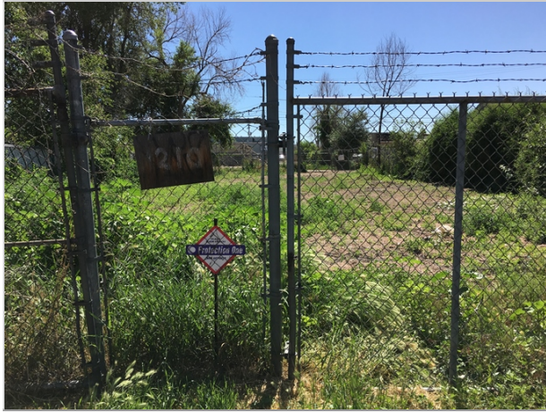
Ideal Live/Work: 1,128SF "House" On 6,350SF Lot