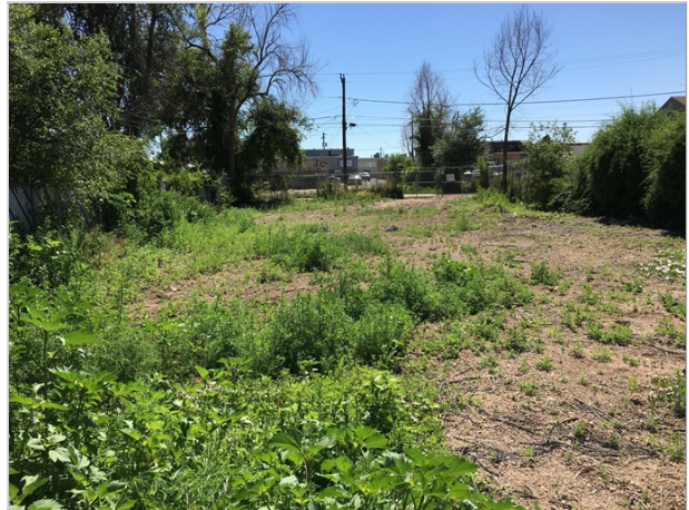
Ideal Live/Work: 1,128SF "House" On 6,350SF Lot