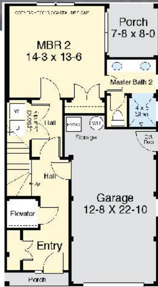
1st (Ground) Floor 8' Ceilings