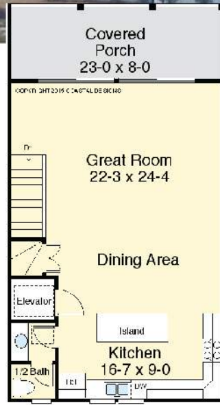
3rd Floor W/ Standard Kitchen 9' Ceilings