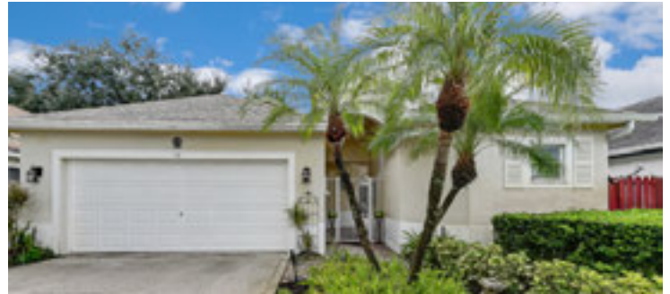
116stirrupln.com Lakefront home with 1 bedroom & 1 bath guest house and a wonderful courtyard in Saratoga at Royal Palm.