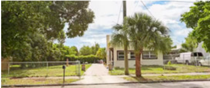
3818greenwoodave.com Great home in the community of Northwood