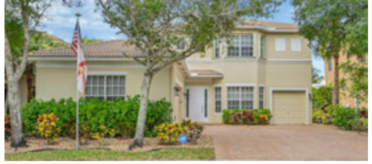
1221creeksidedr.com Elegant home located in the premier Wellington community, Black Diamond.