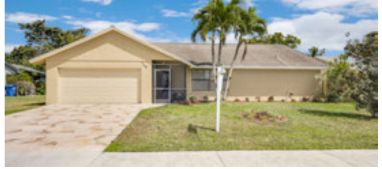
148 Viscaya Ave

Wonderful townhome in Charleston Commons.