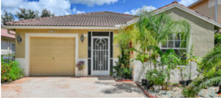
6628countrywindscove.com Update to say Great home in Rivermill