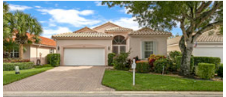
5199bayleafave.com Wonderful home in active adult community of Cascade Lakes