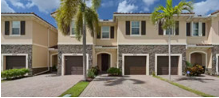
4311 Chalmers Ln

Wonderful townhome in Charleston Commons.