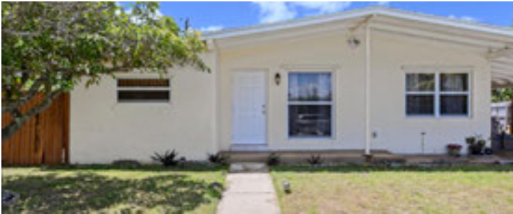
1420wbroomest.com Great home in Lantana neighborhood.