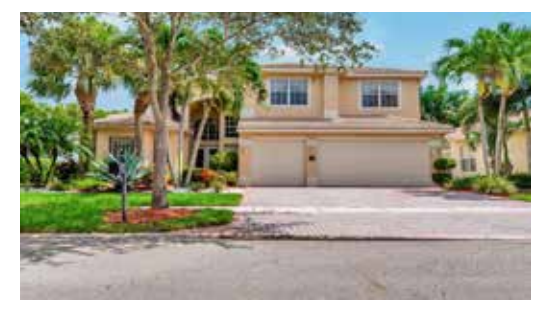
7869 Amethyst Lake Point Expansive estate home in upscale, active adult community Valencia Shores!