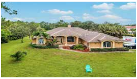
945 66th Terr Wonderful pool home with 1/1 guest house, a 3.5 car garage, on 2.5 acres with NO HOA located within an excellent school zone!