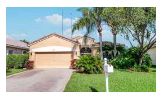
9935 Torino Drive Gorgeous, lakefront home on a cul-de-sac, in upscale community of Bellaggio