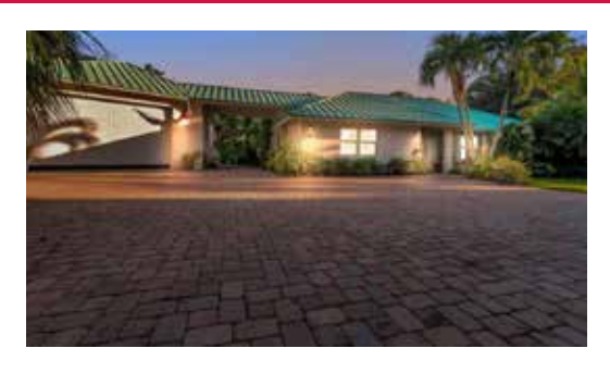
8363 Bowie Way Expansive property in Palm Beach Ranchettes where you can walk to A rated schools!