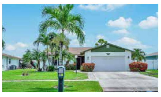
275 Foresta Ter Great single family home with no HOA in central West Palm Beach location!