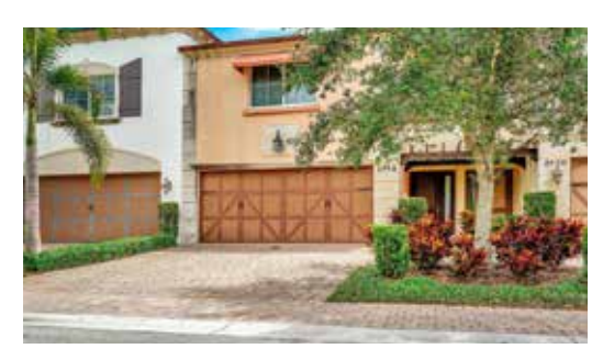
2114 Foxtail View Court Like new, townhome in desirable, upscale community offering 3 bedrooms plus a loft and a garage!