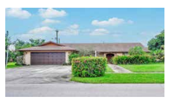
7542 St Andrews Spacious 4 bedroom pool home on an expansive lot in desirable Palm Beach National!