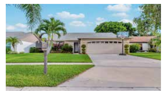
5065 Arbor Glen Circle Flawless home in excellent school zone!