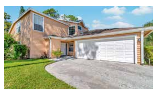
13097 Quiet Woods Rd Beautiful Wellington townhome with attached 2 car garage and tons of upgrades!