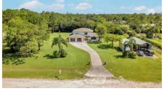
16244 E Whitton Drive Expansive pool home situated on almost 2 acres!