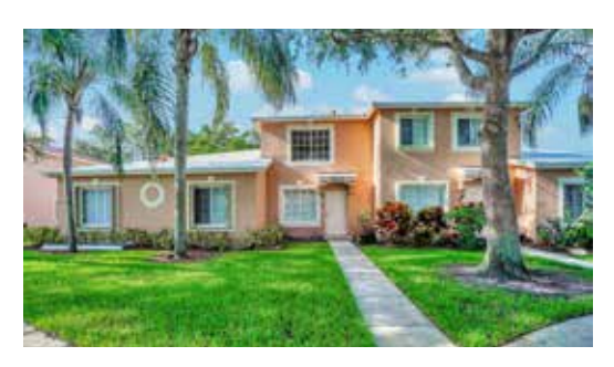
9908 Kamena Cir Beautiful townhome featuring 2 bedrooms and 2.5 bathrooms!