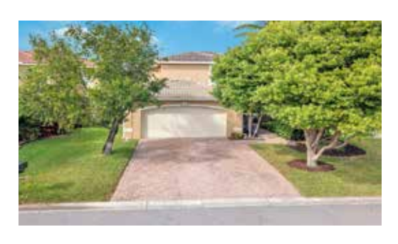
5075 Nautica Lake Cir Gorgeous, 6 bedroom, lake front home in gated community of Nautica Isles!