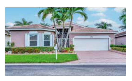
6305 Harbour Oak Dr Located in the desirable, gated, golf course community of Lacuna/Atlantic National in west Lake Worth, which is in an excellent school zone.