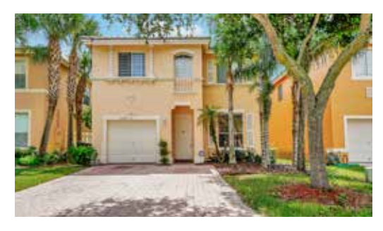
4392 Lake Tahoe Circle Great 4 bedroom home located in gated central West Palm Beach community close to everything!