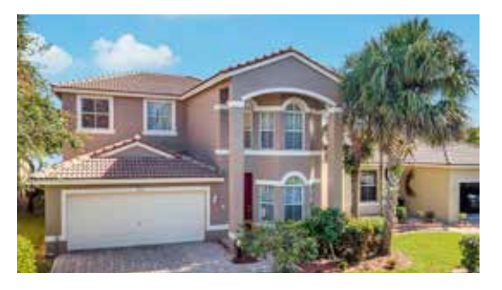
6767 Jacques Way Lakefront replica of builder's award winning model situated on a large lot