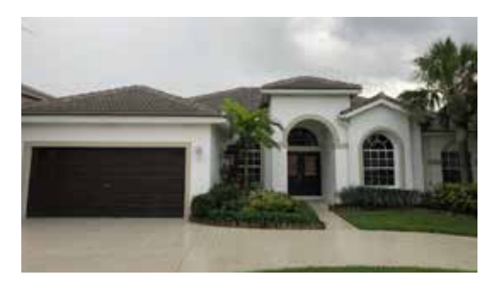
11180 Winding Pearl Way Gorgeous 4 bedrooms, pool home in Grand Isles of Wellington