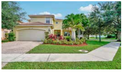
5026 Solar Point Drive Expansive home in gated community of Nautica Isles offering 6 bedrooms (2 bedrooms downstairs) situated on a gorgeous corner lot!