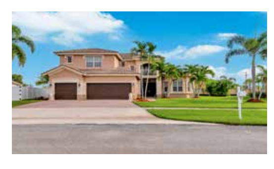
10067 Freesian Way Gorgeous 5 bedroom, pool home in Farmington situated on an expansive lot with no neighbors behind!