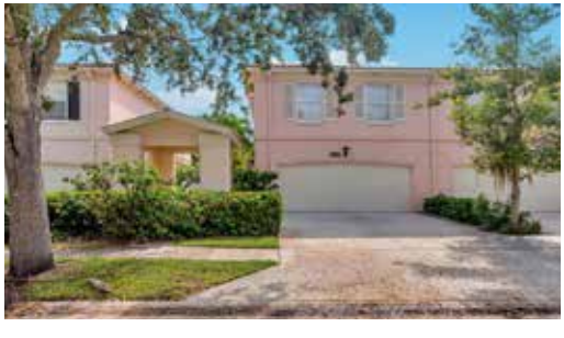
2058 Tarpon Lake Way Gorgeous townhome with attached garage in Riverwalk a gated, located in West Palm Beach close to everything!