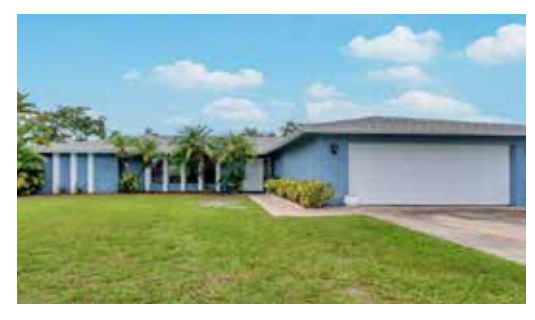
46 Cleveland Rd Wonderful lake front, pool home on expansive lot in desirable Florida Gardens!