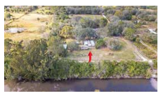
4696 Windmill Rd Expansive equestrian property on over 5 acres!