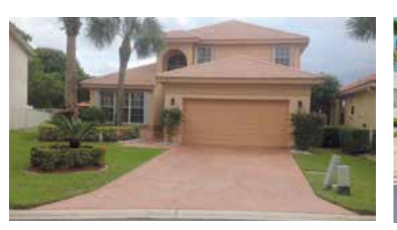
6649 Remington Beautiful home in resort style community of Winston Trails which is located in an excellent school zone.