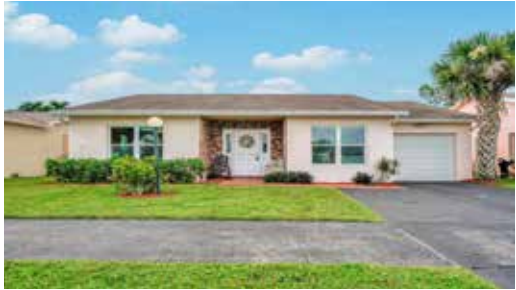
7468 Pine Park Drive Beautiful home with amazing lake and golf course views!