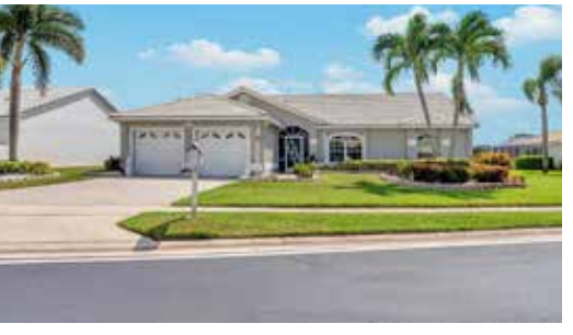
8760 Grassy Isle Trail Beautiful lakefront home in the desirable, West Lake Worth community of Lakes of Sherbrooke!