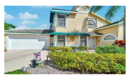
8112 Covington Court Beautiful home located in the desirable golf course community of Lacuna in west Lake Worth, which is in an excellent school zone.