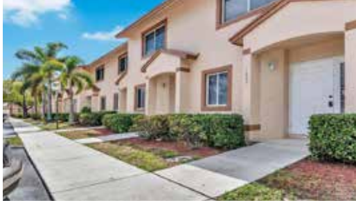
1807 Lakeview Drive Spacious 2 bedroom, 2.5 bathroom townhouse in the heart of Royal Palm Beach close to everything!