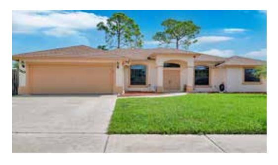
110 Monterey Way Beautiful custom 4/3 lakefront home in Saratoga that is made for a mother/daughter setup. This is a Royal Wall built home