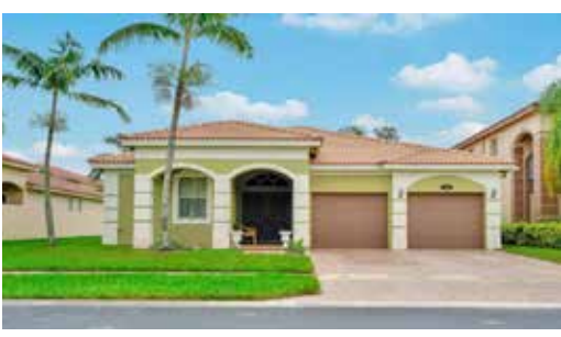
10689 Old Hammock Way Beautiful lakefront home in resort style Wellington, Florida community