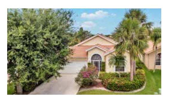
7553 Oakboro Drive Gorgeous lakefront home in desirable Lake Charleston which is within an excellent school zone