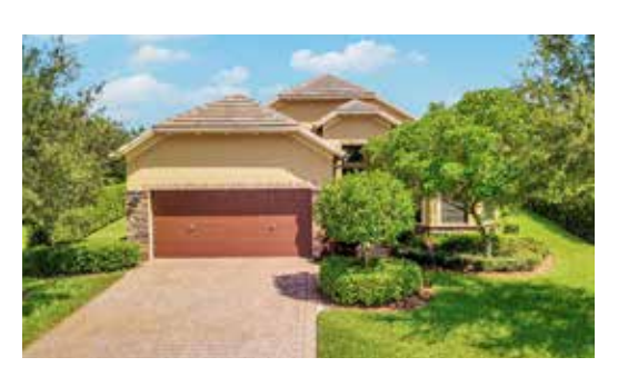
3308 Florence St Take a look at this lovely three bedroom plus den home situated on a large, .54 acre lot in eastern Wellington!