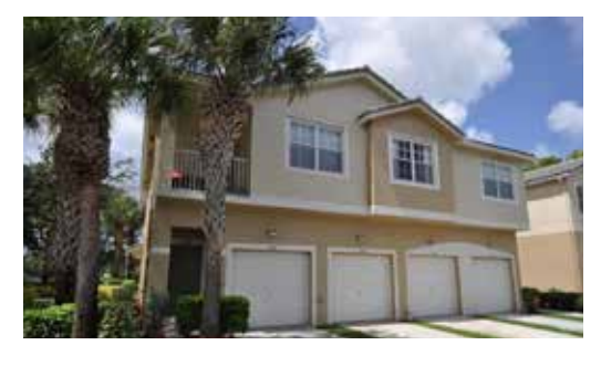
3057 Grandiflora Great 2/2 condo with garage in gated community close to everything!