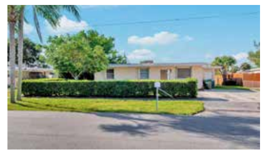
165 Morgans Way Great pool home in desirable Palm Springs with no HOA!