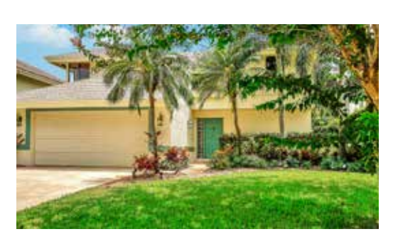
6624 Sweet Maple Lane Beautiful lake front, pool home in Vista Verde!