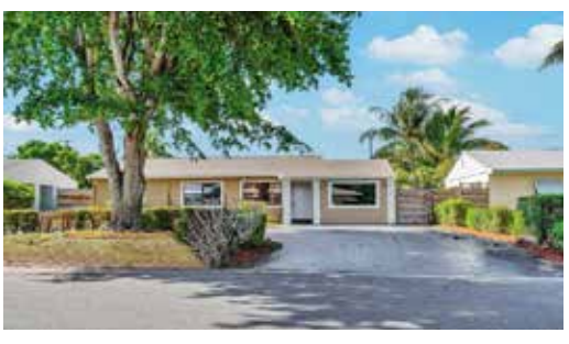
924 Macy Street Flawlessly updated, pool home with guest house, in excellent West Palm Beach location!