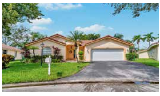
4882 NW 103rd Beautiful 3 bedroom, lakefront home in Brookside