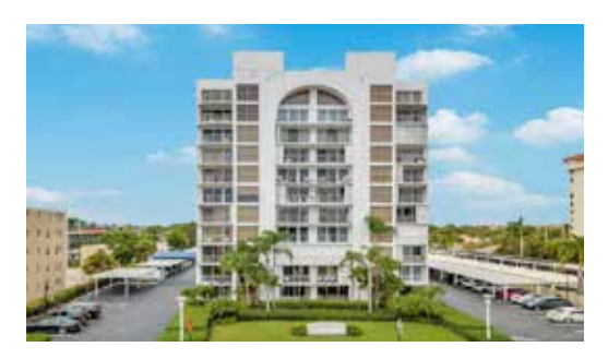
3901 S Flagler Drive #1104 Gorgeous, penthouse, corner unit located on the prestigious Flagler Drive Intracoastal waterfront.