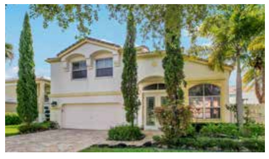
7335 Copperfield Circle Beautiful lakefront, pool home situated on an expansive corner lot in Smith Farm